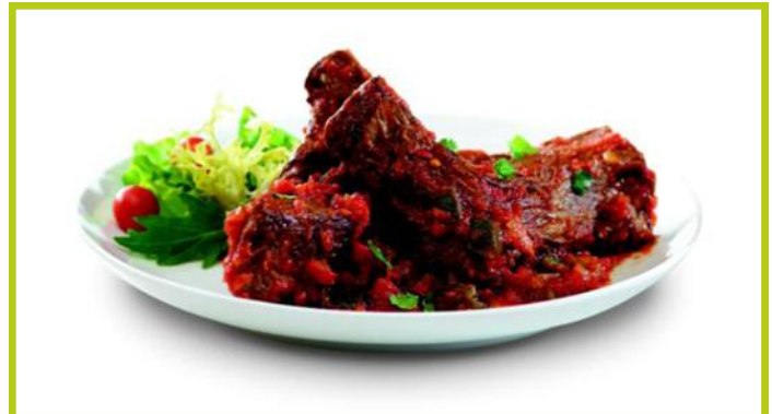
Chipotle Braised Country-Style Beef Ribs

The Boneless Country-Style Ribs are a real crowd pleaser, whether slowly braised with vegetables or finished on the grill with barbecue sauce—they're equally enjoyable reheated!