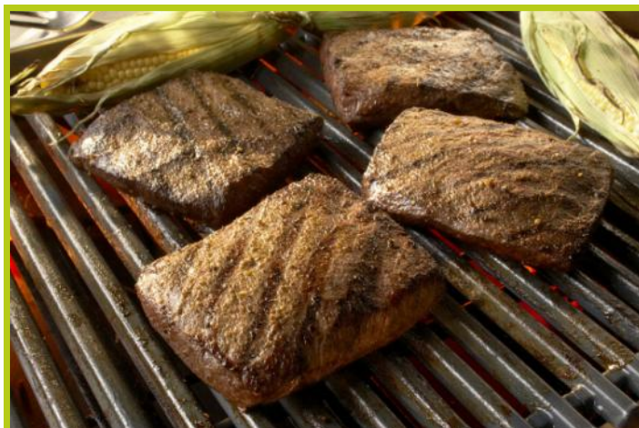
Flat Iron Steaks with Grilled Corn and Cumin-Lime Butter

These rectangular steaks average 8 ounces each. The thickness of each Flat Iron varies from 3/4 inch to 1-1/4 inches. For this reason, in recipes, this cut is called for by weight, not by thickness. Flat Iron steaks can also be cut into strips for stir-fry or cubes for kabobs.