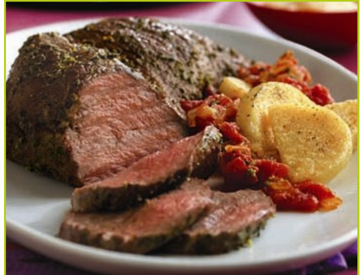
Pesto Rubbed Tri-Tip Roast with Warm Tomato Sauce

The history of the Tri-Tip is storied and colorful. The cut had been used for Ground Beef or sliced into strips or "Sirloin Tips" until the late 1950s, when a grocer in Santa Maria, Calif., decided to try it barbecued over local red oak wood. The decision proved successful as the roast came out tender and flavorful! The grocer began selling and marketing the Tri-Tip and soon it gained popularity across California. The Tri-Tip is still predominate in the West, but is becoming available across the rest of the country. If you can't locate it at your supermarket, ask your meat manager if it can be ordered.